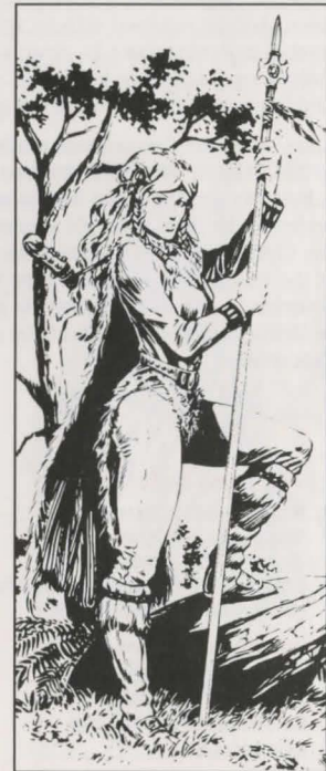
from "Dragons of Mystery"

Rejected by their tribe, Goldmoon and Riverwind traveled to attempt to discover the Staff's true nature. During their travels, they became involved in a fight at the Inn of the Last Home and were rescued by the other Companions. From the Inn, the Companions' adventures took them to Xak Tsaroth. In those terrible ruins, the Blue Crystal Staff was destroyed, but the Disks of Mishakal were recovered and Goldmoon became the first True Cleric since the Cataclysm. Goldmoon now wields personal clerical magic and directs the awesome powers of the Disks of Mishakal.