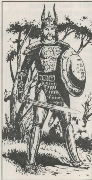
from "Dragons of Mystery"

Having gained his inheritance by this time, Sturm was equipped as a Knight of Solamnia, and this meeting marked the start of the Companions' involvement in the 'War of the Lance', when they rescued Goldmoon and Riverwind. Returning from the ruins, Sturm is full of pessimism about the spread of the Draconian forces but determined to try and help stand against their evil, even though he believes the Companions' numbers insufficient to make much difference.