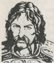
By Larry Elmore, from "Dragons of Hope"

The son of a true Knight of Solamnia, Sturm was sent south with his mother for safety when his father could no longer guarantee the security of their home. His father was to have sent for them when things calmed down – he never did. At this time, the Knights were looked down upon by the general population, who blamed them for failing in their duties by not stopping the Cataclysm.