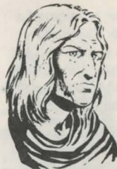
By Larry Elmore, from "Dragons of Hope"

So weak when he was born that he wasn't expected to live, Raistlin survived through his sister's efforts and the protection of his twin brother Caramon. Just before their fifth birthday, the twins were taken to a fair where a conjurer performed tricks and illusions. Caramon watched for a while and wandered off, but Raistlin stayed all day and then astonished his family by reproducing every trick he'd seen.