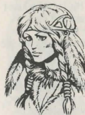
from "Dragons of Hope"

Daughter of the chieftain of the Que-Shu tribe, Goldmoon's future seemed to be set from birth; whomever she married would become chief of the Que-Shu. Unknown to everyone, the gods had different plans for her. The first sign of these plans came when Goldmoon fell in love with Riverwind rather than any of the other more suitable young men.