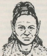
By Larry Elmore, from "Dragons of Hope"

Most people not only don't understand Kender but don't want to know them. This is often due to their basic personality traits: fearlessness, unbelievable curiosity, irresistible mobility, independence and the need to pick up anything not screwed down (unless they have a screwdriver, in which case...)