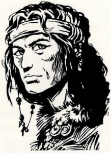
from "Dragons of Hope"

Born into a family of virtual tribal outcasts, no-one in the Que-Shu tribe had a lower social position. His family refused to believe in the divinity of the tribal chieftain and were the last believers in the old gods. Tolerated for his skills, Riverwind would probably have been left alone to live his life had he not asked permission of the tribal chief to marry Goldmoon.