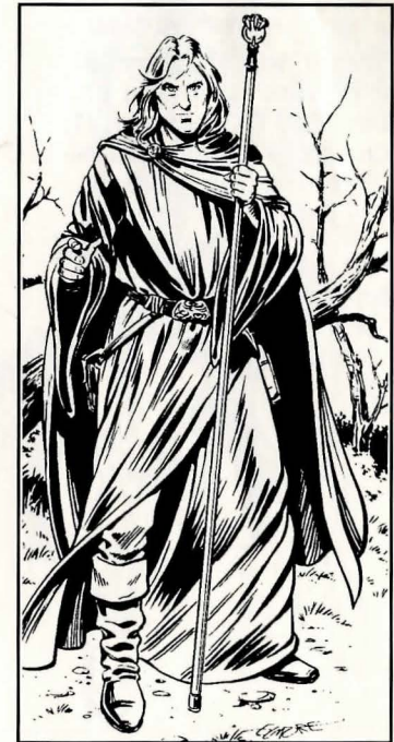
By Larry Elmore, from "Dragons of Mystery"

Staff of the Magus (+3 protection; +2 to hit - damage 1-8); Close combat with Staff as weapon; Ranged combat - see spell list.