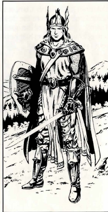
By Larry Elmore, from "Dragons of Mystery"

Ring mail armor; Longsword (damage 1-8); Spear (damage 1-6).