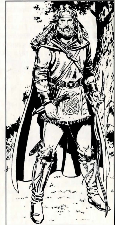
By Larry Elmore, from "Dragons of Mystery"

Leather armor +2; Longsword +2 (damage 1-8); Bow & quiver of 20 arrows (damage 1-6).