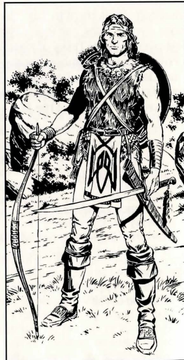
from "Dragons of Mystery"

Later, when the Companions made their way to Xak Tsaroth, Riverwind realized that the ruined city was the place from where he had retrieved the Staff. After his adventures with the Companions, he has seen the magnitude of the destruction wrought by the Draconians. Riverwind's aim in life is now the protection of Goldmoon and the destruction of the Draconians.