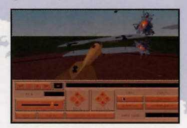
Blast your way through dangerous, lowlevel attacks. (RBMB)