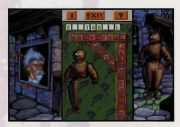
Send your brain on a puzzling trip through the Castle of Dr. Brain.