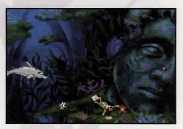
Scour the seven seas and save the planet in The Search for Cetus.