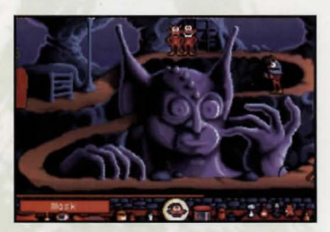
They're frisky, funky and furious, but with you along they're ingenious. (Gobliins)