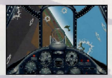
Working cockpit gauges and enemy bullets ripping through your canopy add to the realism. (RAF in the Pacific)