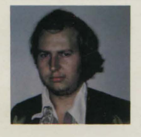
About the author