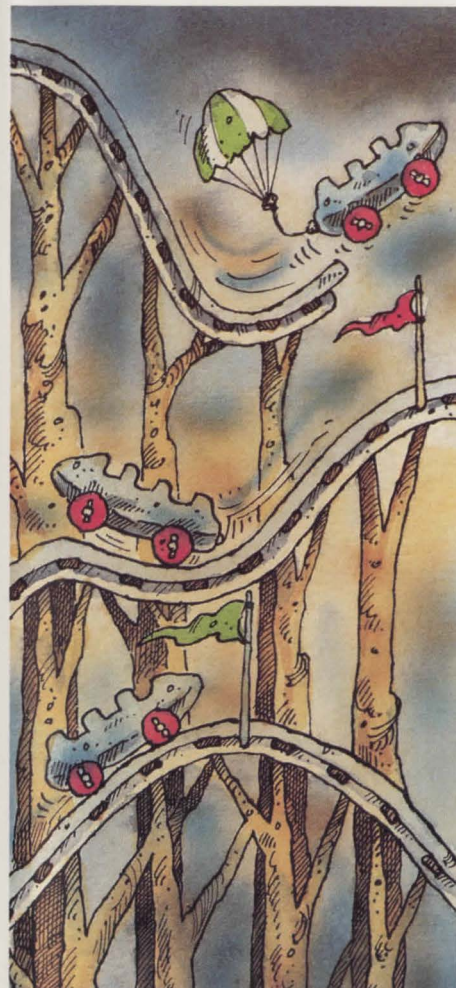
THE ROLLER COASTER: Hold onto your glorbs! You'll travel faster than you've ever travelled before. Magic and engineering combine to create the most thrilling experience imaginable!