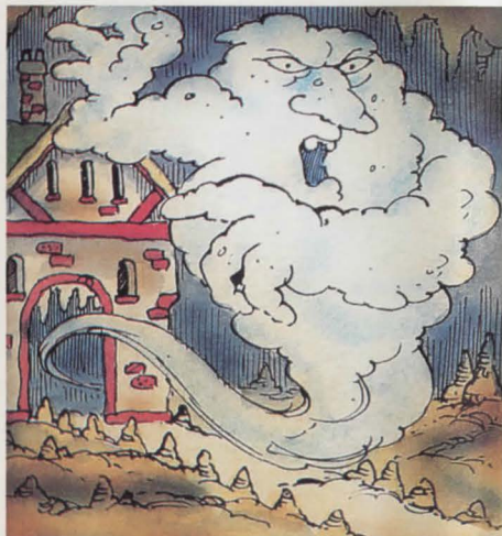
THE HAUNTED HOUSE: The only authentic haunted house you'll ever visit. We've imported ghosts, goblins, spooks, spirits and apparitions from all over the Kingdom. You'll never forget your walk through the Haunted House... IF you get out alive!