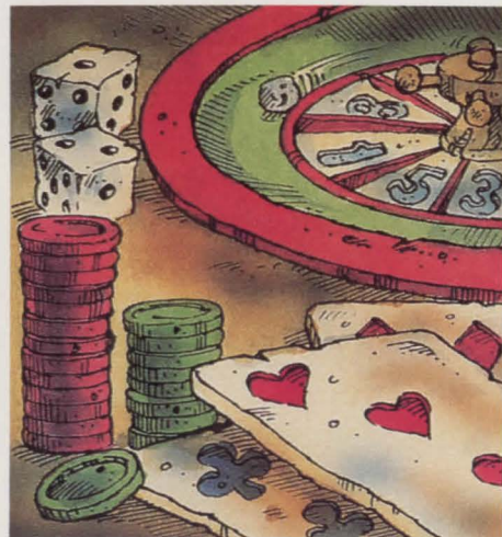
THE BOZBARLAND CASINO: Name your favorite game of chance and we've got it. Roulette, double fanuci, burfle, blackjack and more! You'll have the time of your life and maybe walk out with a million zorkmids!