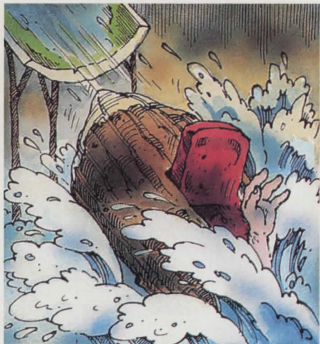
THE FLUME: This splash-filled log boat ride is the largest of its kind anywhere in the world. You'll never trust a water vehicle again!

Bozbarland is just a short trip away, at the western end of the Great Underground Highway. Admission is just one zorkmid, all year round! And be sure to take in Bozbarland's many neighboring sights, the highlight being ancient Egreth Castle, the home of old King Duncanthrax. Make sure your vacation includes a stop at Bozbarland!