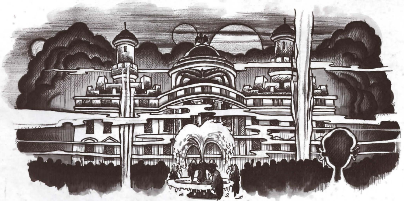
"Enchanter Hall on the scenic G.U.E Tech campus, where Belboz the Necromancer recently addressed young Enchanters of tomorrow."