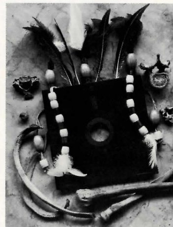
People of Utunga do not consider the disks to be supernatural beings but flesh and blood creatures which possess some degree of intelligence and are capable of a human-like sensitivity.

When you play INFIDEL, or any other INTERLOGIC™ game, you type your commands in plain English. You can pretend that all your sentences begin with "I want to . . ." although you should not type those words explicitly. INFIDEL will digest your request, then tell you whether