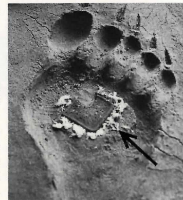
Footprint of Berlyn's abductor. Arrow indicates reuben sandwich Berlyn dropped during struggle. Police are on the lookout for dark, hairy male, about 8' tall, 560 pounds, with sauerkraut on sole of foot.

When people asked if he wouldn't like to visit the scenes of some of the harrowing experiences he depicted so vividly, Berlyn would respond, "You mean outdoors?! Do you have any idea how many bacteria are floating around out there? Now go away and quit breathing on me." But wouldn't he find it inspirational to get back to