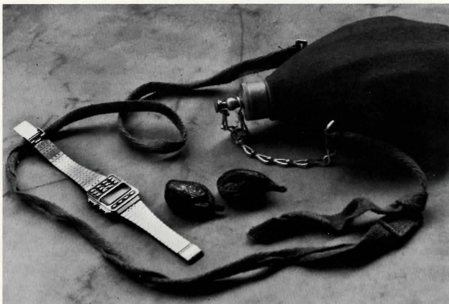
A ration of fermented camel milk and dried dates kept the Captain alive for over three weeks as he wandered aimlessly through the catacombs. This electronic watch, which was programmed to play "Skip to My Lou My Darling" and the "Gregorian Funeral March" at 15-minute intervals, helped keep Spaulding's mind from slipping into the hopeless morass of insanity.

Until you have mastered those death traps of the pyramid, you might find it useful to play INFIDEL with another person. One person might find a problem difficult while another might find it easy, so two players often complement each other.