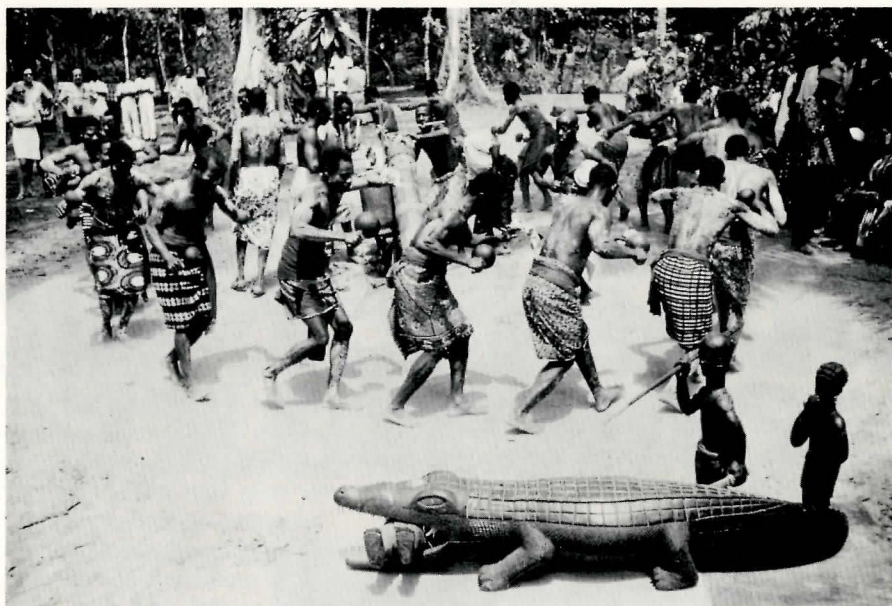
Blood-curdling magic disk rituals: In this variation on "Musical Chairs," Utungan tribesmen thank Crocodile God for bringing them the disk by feeding him those worshipers who fail to "freeze" when the conga beat stops. Unfortunately for guest participant "Tiny," the expedition's Pygmy guide, he never had a sense of rhythm.

EXAMINE THE LARGE CRATE. PUSH THE TRUNK. BREAK THE LOCK WITH MY HANDS. DESTROY THE MAP. LOOK UNDER THE COT. READ THE COUPON.