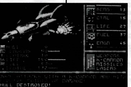
Combat in space

Buck has mouse support, and people who enjoy it say a mouse speeds up the game and makes operations less tedious. In some situations, such as flying, mouse control excels the keyboard. Joystick is also supported for movement.