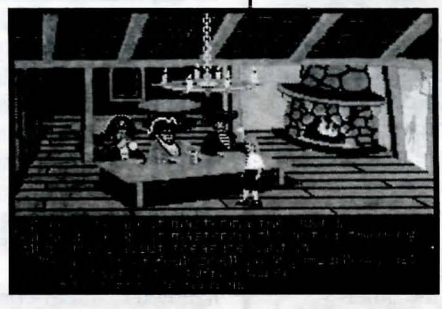
Amusing menu choices