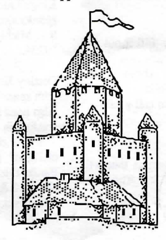
QB: Will there be gems to help in mapping?

The fountains in the dungeons are now bit-mapped, water actually flows in them, and you get sound effects. In caverns you can stand in a long corridor of stalagtites and see each individual one drip water, see the drop hit the ground in a little puddle, and hear a little splash. So the sound effects are going on all around you in these different environments, to lend an air of authenticity. And the monsters are animated, bit-mapped and masked.