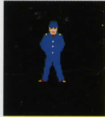
SGT. JEFFERSON - The Police Sergeant in charge of law and order in sleepy Tynham Cross.