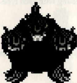
Hydra – Vicious Hydra

Discretion is the better part of staying alive.