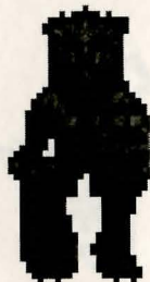
Gendor (large green lizard) – Gendor of Trinadon

To equip yourself with an item, display the Equip screen by pressing the E key. Use the joystick or the arrow keys to move the highlight to the item you want to equip. As the prompts at the bottom of the screen show, press L to put the item in your left hand, R to put the item in your right hand, G to put on gauntlets (this only works for gauntlets or gloves), H to put on a helmet, and A to put on armor. If you want to remove an item, either select another item for that