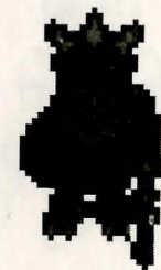
Kobold (small red demon) – Evil Incarnate

Some creatures won't attack you unless you attack them first. Others are highly aggressive, and will attack with great ferocity the instant you appear. Some will wander about at random, and only attack you if you happen to get near them. As you adventure, you'll discover the different personalities and learn the best ways of dealing with each type.