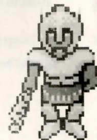
Ogre – Jedist Ogre