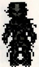
Vine Man - Vine Man