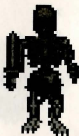
Skeleton – Skeletal Giant

Many actions, such as opening doors and taking treasure from chests, happen automatically when you get close. You can also use keyboard commands to perform these functions when you are not in the right place for automatic action. Press the O key to open closed doors, grates, or chests. Press the C key to close doors, grates, or chests