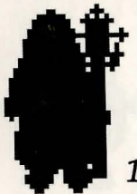
Priest (blue robes) – Arch Priest

Daggers: These are small, usually double-edged knives, quite commonly used by goblins. One type of dagger, the main gauche, is useful for parrying, and so adds to your Defense.